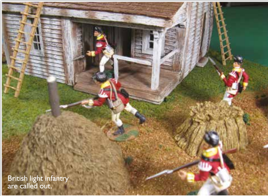
British light infantry are called out.