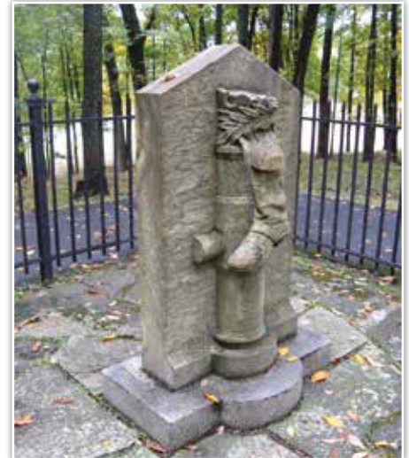
The battlefield's "Boot Monument" memorializes Arnold's wound and his heroism at Saratoga. His name, however, was omitted due to his later changing sides in the war.