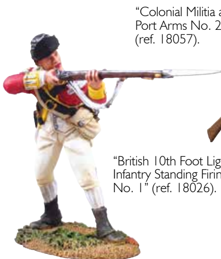
"British 10th Foot Light Infantry Standing Firing No. 1" (ref. 18026).