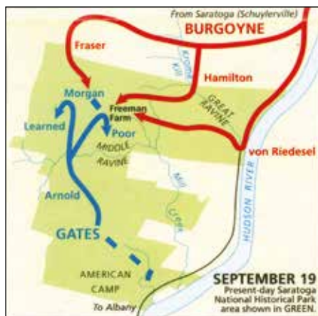
Map showing the opposing armies' movements during the First Battle of Saratoga.