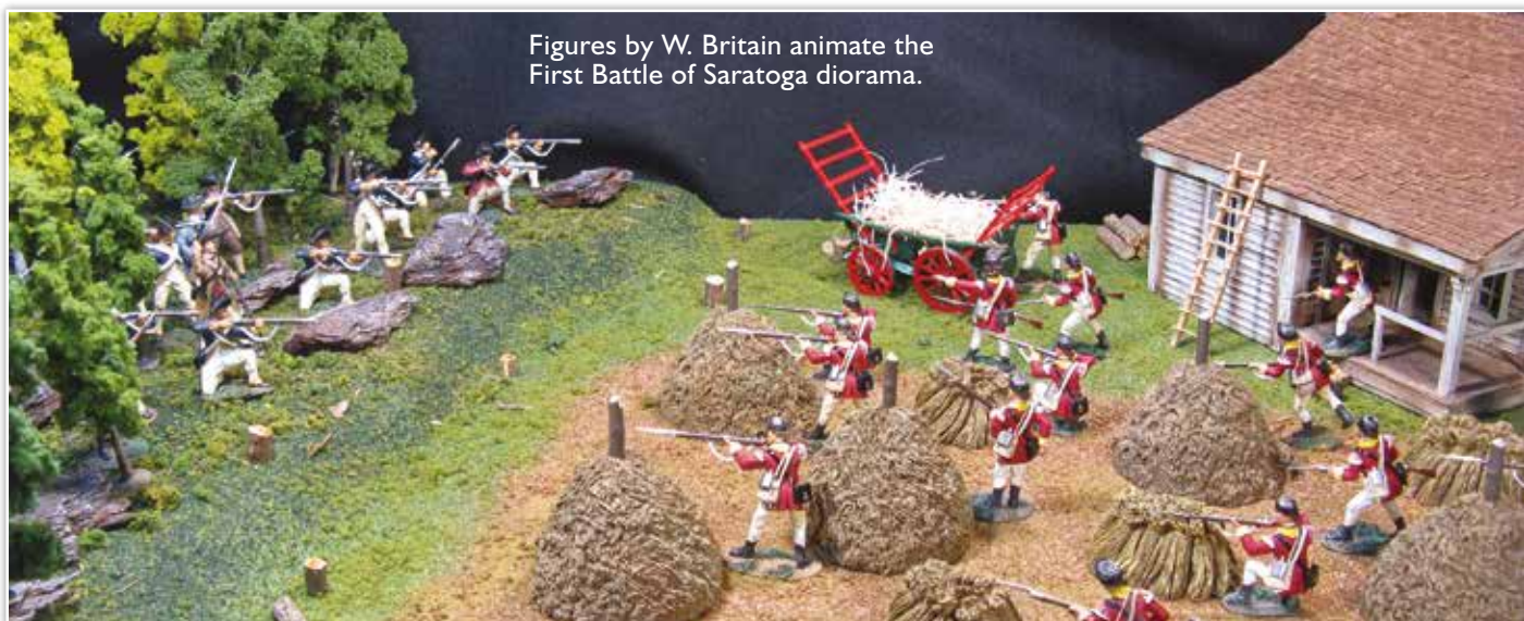
Figures by W. Britain animate the First Battle of Saratoga diorama.

St. Leger's force met stiff resistance at Fort Stanwix (Rome, N.Y.), an American