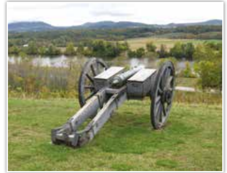
Bemis Heights overlooking the Hudson River.