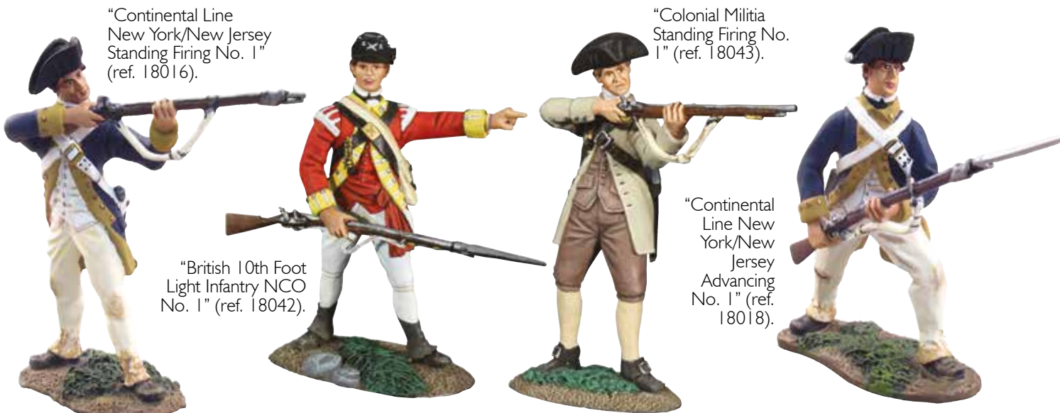
"Continental Line New York/New Jersey Standing Firing No. 1" (ref. 18016).