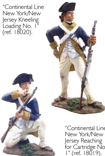
"Continental Line New York/New Jersey Reaching for Cartridge No. 1" (ref. 18019).