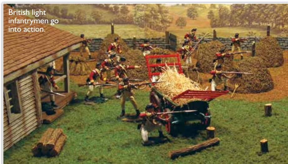
British light infantrymen go into action.

They were low on forage for their horses. The men were on half-rations. Many of the Redcoats had succumbed to weakness and disease. Winter was coming soon.