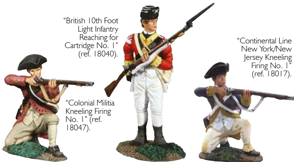
"British 10th Foot Light Infantry Reaching for Cartridge No. 1" (ref. 18040).

The Battles of Saratoga had such far-reaching impact that the clash became known as the "Turning Point of the Revolution." Because of Saratoga's effect on the course of the future, many historians rank it among the top 15 battles fought throughout world history. ■