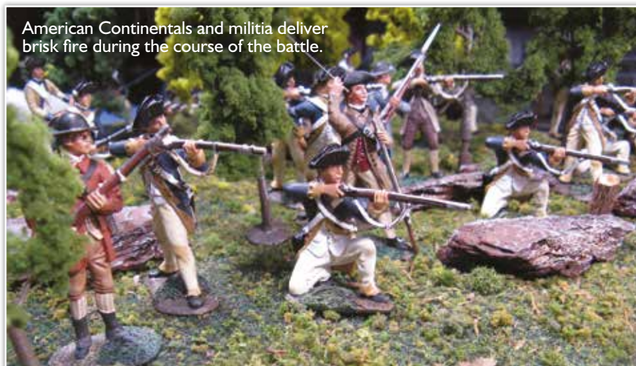
American Continentals and militia deliver brisk fire during the course of the battle.