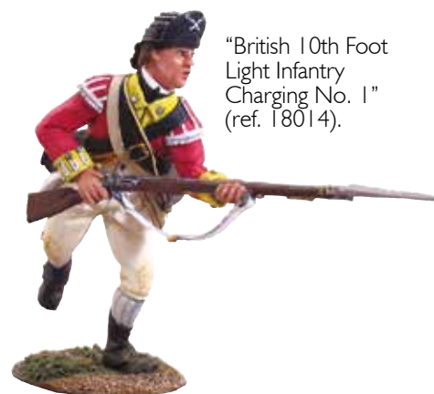
"British 10th Foot Light Infantry Charging No. 1" (ref. 18014).

Burgoyne's plan called for the three British forces to link up at Albany and