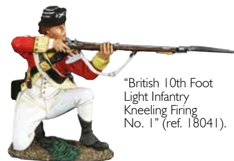
"British 10th Foot Light Infantry Kneeling Firing No. 1" (ref. 18041).